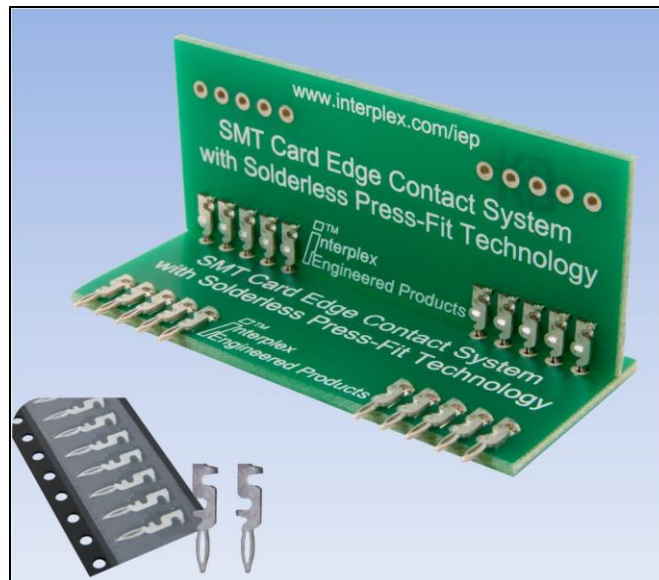
Figure 2 - Optimizing Automation and Reliability

Provided in standard tape-and-reel or continuous-stamped formats and using a strong through-hole SMD design for maximum mechanical strength, SMT Card-Edge Press-Fit interconnects integrate seamlessly with all of the existing processes used for assembling and soldering mixed-technology mother-boards. With proven solderfree, eye-of-the-needle press-fit contacts on the daughter-board side, this approach also completely eliminates the need for and secondary soldering operations and the risks associated with re-heating of the mother-board assembly.