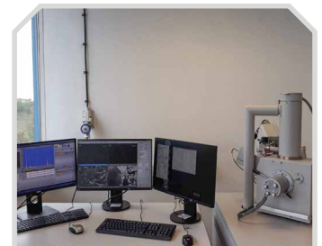
SEM & EDX