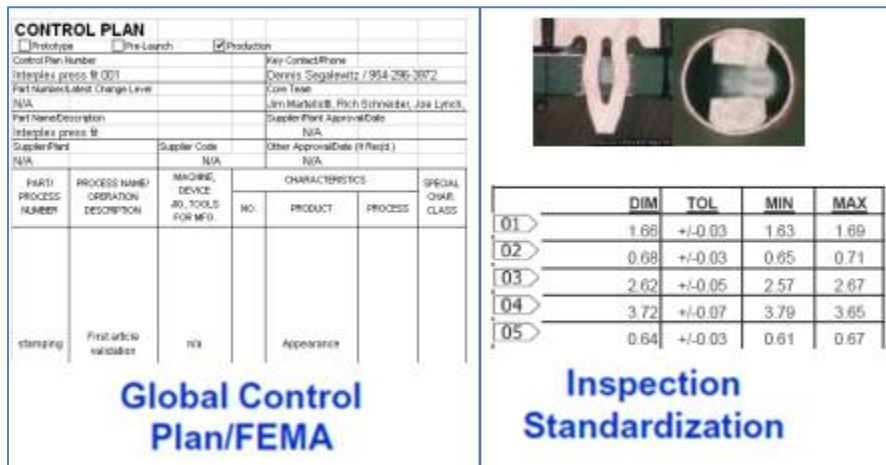
Figure 4 – Global Production Control Processes

Achieving the required level of consistency requires suppliers to invest in disciplined and documented Global Process Control Plans and Inspection Standardization.