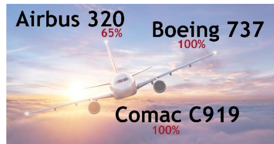
Figure 1 - Major Airframes Using LEAP Engines and Their Respective Market Shares

These smaller, fuel-efficient engines open new opportunities for airlines to extend the range of mid-size airframes and enable “right-sizing” of passenger capacity. By flying these smaller airframes on intercontinental routes, they improve efficiency while transporting more people to more places around the world.