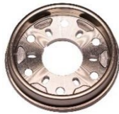
Figure 7 – HDD Disk Clamp (6061 Aluminium Alloy)