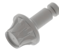
Figure 12 – Mining Bit (15B37H Medium Carbon Steel)