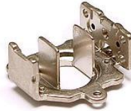
Figure 8 – HDD Optical Pickup Yoke (SPCC Cold Rolled Steel)