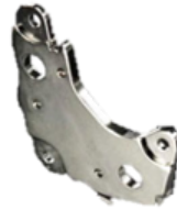
Figure 5 – Yoke Plate for HDD Voice Coil Motor Actuator (SPCC Cold Rolled Steel)