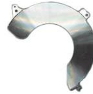
Figure 6 – HDD Disk Separator Plate (5052 Aluminium Alloy)