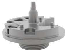
Figure 10 – Automotive Seat Belt Component (16MnCr5 Alloy Steel)