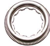
Figure 9 – Power Tool Cap (6061 Aluminium Alloy)