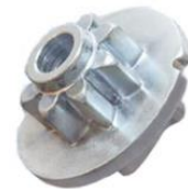
Figure 1 – Cold Forged Automotive Seat Belt Gear

As detailed in other Interplex Tech Bulletins, Cold Forging is essentially an impact forming process in which billets of raw material are compressed and reformed into a part's desired shape. Cold Forging offers the key benefits of lower costs, rapid high-volume throughput, high part strength, and very efficient material utilization. This, in comparison to processes like machining that remove significant amounts of raw material rather than simply reforming all the material into the desired shape.