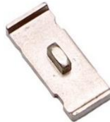
Figure 11 – Earphone Support Plate (SPCC Cold Rolled Steel)