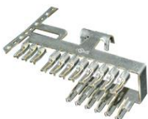
Figure 2 – Precision Stamped Busbar

Precision Stamping is another proven technology that uses a press and die to form sheet metal, blanks or coil material into desired shapes. Variations of the stamping process can effectively yield several different output results including bending, embossing, flanging, coining, etc.