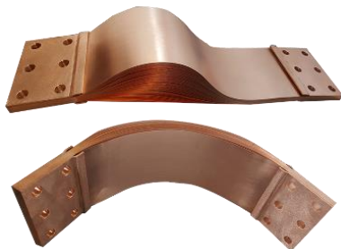
Figure 4 - Flexible Busbars Are Made Up of Copper Lamels

Interplex's flexible busbars are easily customizable for compatibility with specific assembly environments and end application requirements. As a leader in customized application solutions, our expertise covers end-to-end design, production and testing support for product engineers seeking to incorporate flexible busbars into power systems.