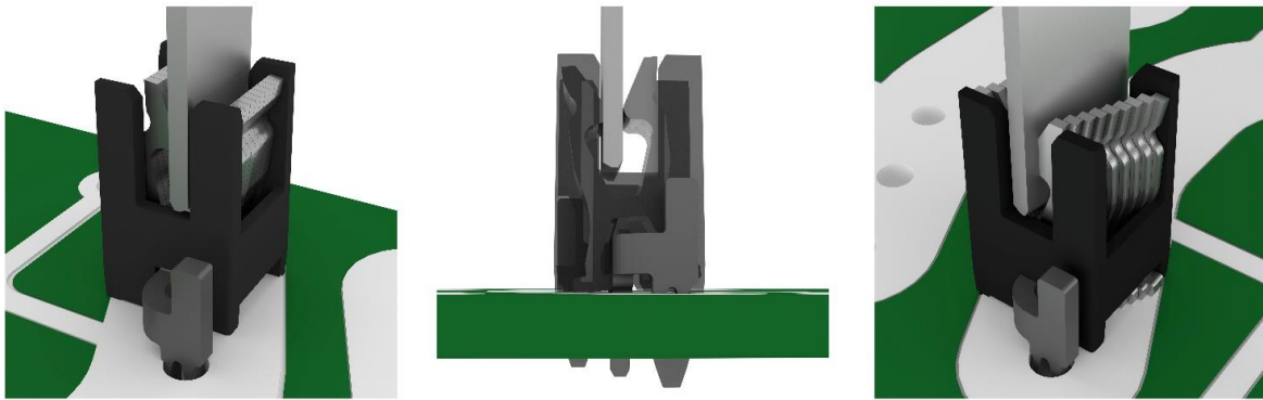
Figure 2 - BusMate™ Accommodates Large Assembly Tolerances

BusMate™ applications span across a variety of industries including, automotive, energy, transportation, industrial, datacom & telecom and medical & life sciences. It is especially useful for applications such as motors and pumps, hybrid vehicle power systems, electric power steering, charging systems, power mechatronics, Brushless Servo Motor (BLDC) systems, traction drive inverter busbar systems and other emerging power applications.