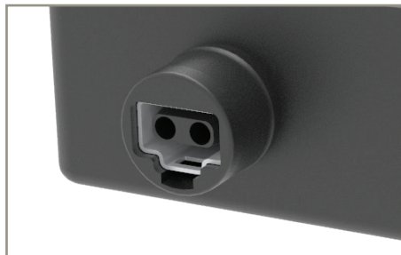
IEC 63171-6 Compliant